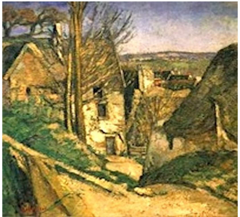
Paul Cezanne, The House of the Hanged Man , 1873, oil on canvas, Musee D’Orsay, Paris.

pend for an unspecified, extended period.