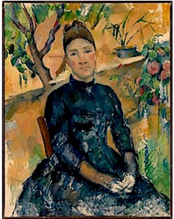
Cézanne, Madame Cézanne in the Conservatory , 1891, oil on canvas, Metropolitan, NYC.