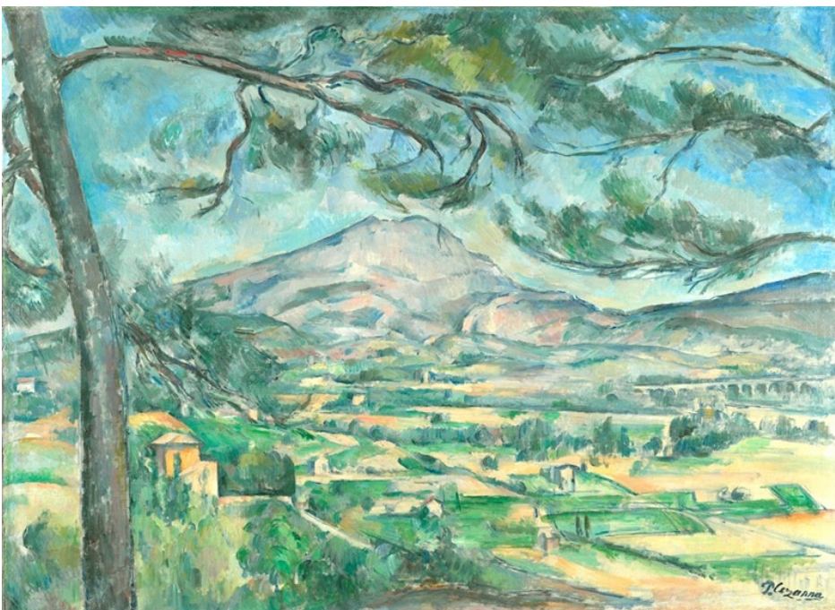
Paul Cézanne, Mont Sainte-Victoire with Large Pine , 1887, oil on canvas, Courtauld Collection, London.

admired the painting. Matisse was drawn to the V shape structure of the terrain and houses. In 1925 he wrote, “ I am very surprised that anyone can wonder whether the lesson of the painter of The House of the Hanged Man and The Card Players (below) is good or bad. If you only knew the moral strength, the encouragement that his remarkable example gave me all my life! In moments of doubt, when I was still searching for myself, frightened sometimes by my discoveries, I thought: ‘If Cézanne is right, I am right.’ And I knew that Cézanne had made no mistake.”