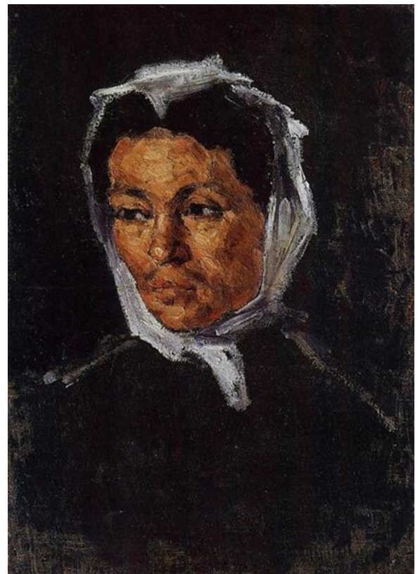
Paul Cézanne, The Artist's Mother , 1866-67, oil on canvas. (On the reverse is a painting of his sister)