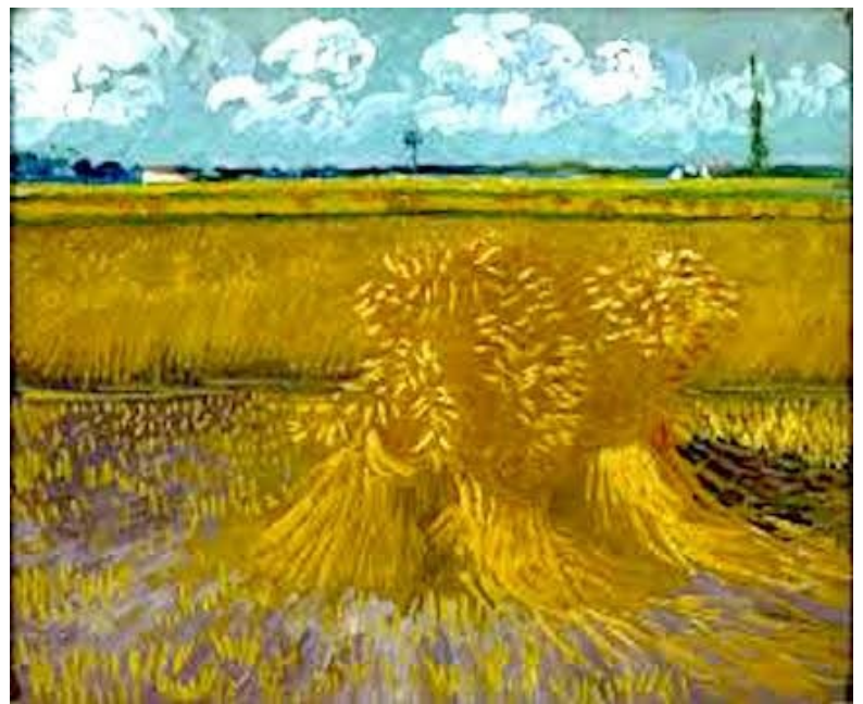
Van Gogh, Wheat Field (Le Champ de Ble') 1888, oil on canvas. Honolulu Museum of Art. This work celebrates the colorful canvases which followed Van Gogh's joining his brother Theo in Paris in 1886.

Claude Monet painted with the Barbizon group in the Fontainebleau Forest in 1865, completing a painting by that title (now in the Metropolitan's collection). However, he increasingly remained on site to complete his work in order to capture the momentary effects of reflected light. This more analytical rendition of the light spectrum launched Impressionism, which became the ultimate pinnacle of French landscape painting. Certainly Vincent Van Gogh's Wheatfield , which hangs at the end of the Barbizon section of our upcoming exhibition, celebrates the exuberant fragmenting of light into individual strokes of color which came to characterize his work and provides a sense of continuity in the language of modern art. ■