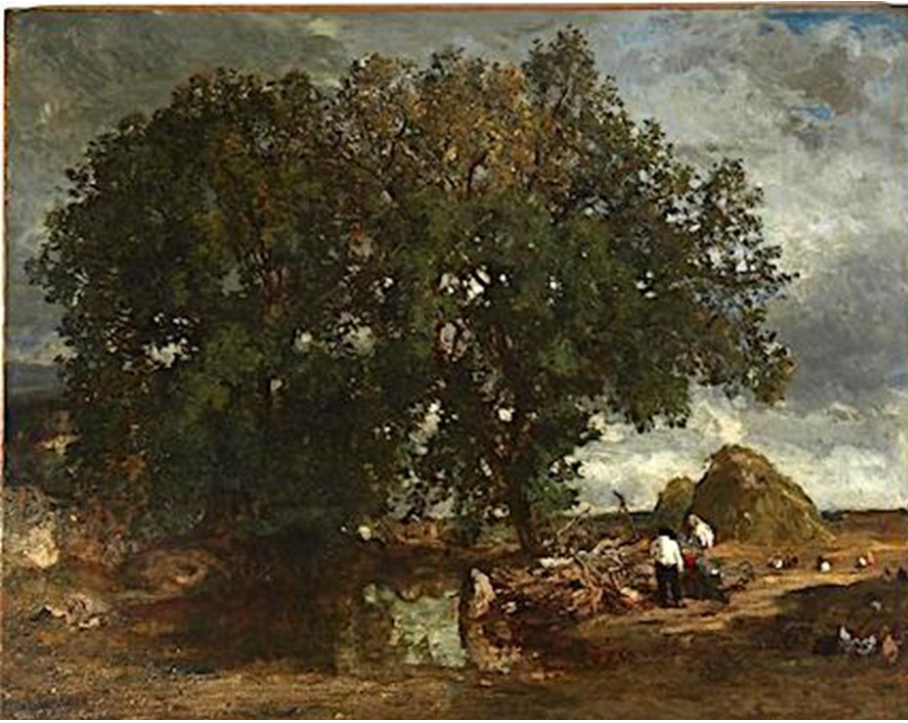
Constant Troyon, Under The Trees , 1847, oil on canvas.

returned to painting porcelain intermittently to support his artistic aspirations. He was introduced to Rousseau and in 1840 followed him to Barbizon, sketching in the forest for the next seven years and refining his studies into finished paintings in his studio. We do see in our Under The Trees echoes of the careful detailing of his craft. It wasn't until he visited Holland later in the year of our painting, that he found his subject, one which he related to with the same passion Rousseau and Corot felt for landscape. Under the brushes of the Dutch animal painters the creatures came to life as breathing presences. Landscape became just the background of his acclaimed animal paintings, which not only earned him the Legion of Honor from the Salon but also the patronage of none other than Napoleon III. In our painting, Corot's lessons of light filtering through a tree were clearly well learned.