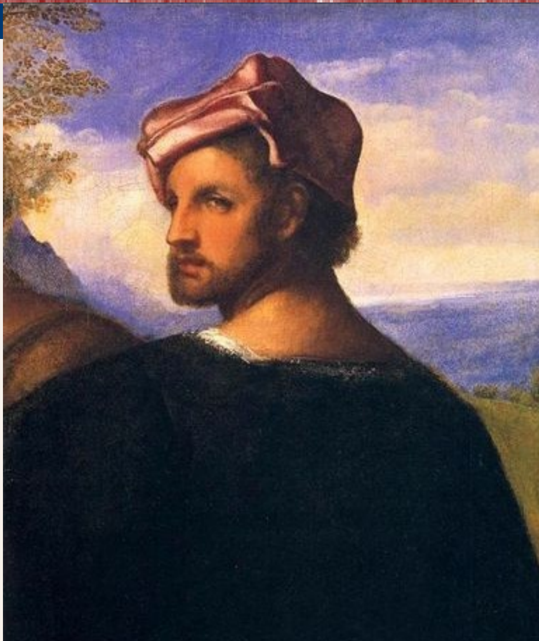
Titian (Tiziano Vecellio), Head of a Man , ca. 1508-10, Oil on canvas, 21 1/4 x 17 1/4 INTERNAL USE