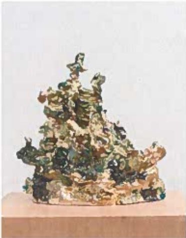
Patricia Iglesias Paco (Argentinian, b. XXXX, active USA) The Pathos of Shape M , 2018 Ceramic, 12 x 11 x 3 in.