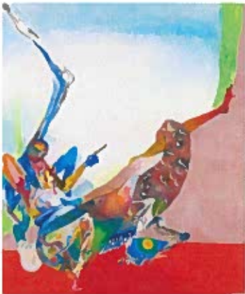
Ilana Savdie (Colombian, b. 1986, active USA) Lágrimas y mocos (exploiting a suitable host) , 2021 Oil, Acrylic, and Beeswax on canvas stretched on canvas, 72 x 60 in. SBMA, Museum purchase with funds provided by The Museum Contemporaries and Kandy Budgor; Luria/Budgor Family Foundation, 2021.19