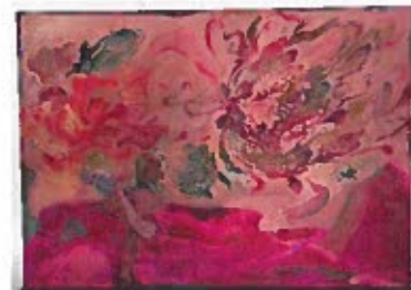
Patricia Iglesias Paco (Argentinian, b. XXXX, active USA) Lavinia Mariposa , 2024 Oil on panel, 60 x 84 in.