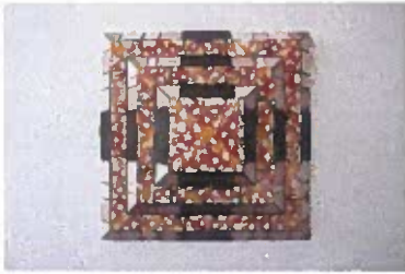
Evelyn Quijas Godínez (American, b. 1990) Equis (X) Concrete tile, ceramic tile, wood, grout, 39 x 39 x 9 ½ in.

Courtesy of the artist and Ever Velasquez