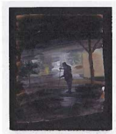
Jay Lynn Gomez (American, b. 1986) Nightsweeper , 2019 Acrylic on cardboard, 38.25 x 31 inches