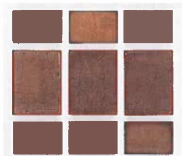
Jackie Amézquita Oro Negro (Black Gold) , 2024 Soil source from Los Angeles neighborhoods, masa (corn dough), salt and cal (limestone) frame with copper, 53 x 60 in. Courtesy of Charlie James Gallery and the artist

Courtesy of the artist and Ever Velasquez