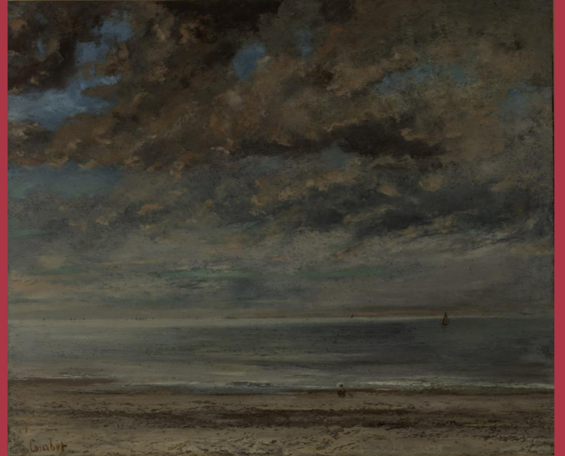
Gustave Courbet, Sunset on the Beach , 1867. Oil on canvas. Bequest of Leslie L. Ridley-Tree