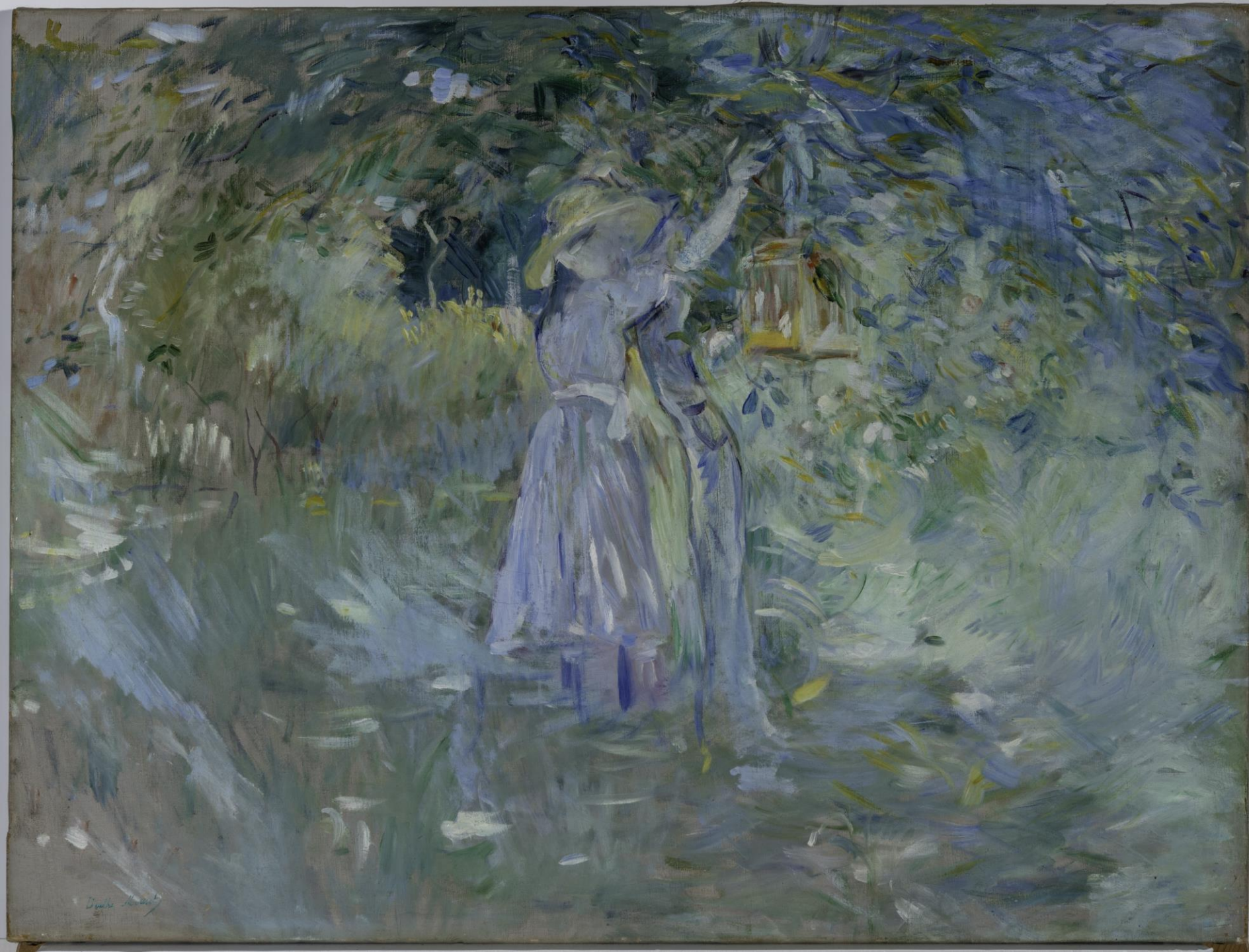
Berthe Morisot, Young Girl Hanging a Bird Cage in a Tree , 1890. Oil on canvas. Bequest of