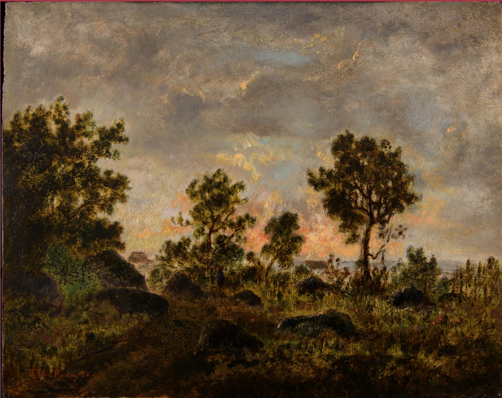
Théodore Rousseau, View of the Forest of Fontainebleau , c. 1850. Oil on panel. Bequest of Leslie L. Ridley-Tree

(Title in Catalogue Raisonné is Les abords de Chailly et de Barbizon or The