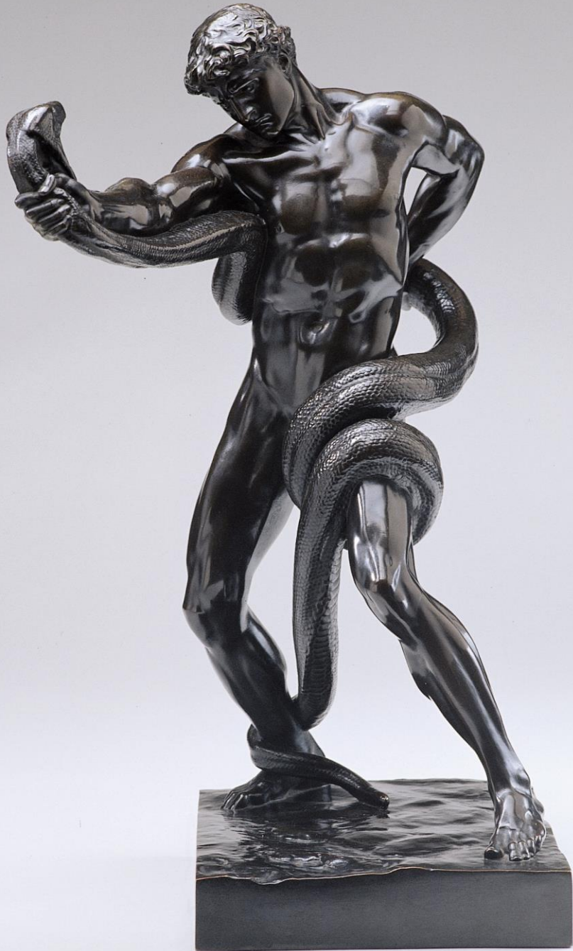
Frederic Leighton, An Athlete Wrestling with a Python , modeled 1877, cast 1903. Bronze. SBMA Museum Purchase with funds provided by Lord and Lady Ridley-Tree.