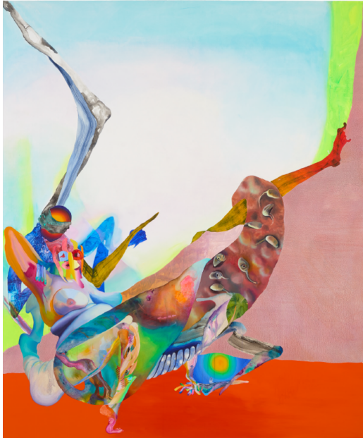
Ilana Savdie, Colombian, b. 1986 Lágrimas y mocos (exploiting a suitable host), 2021

Oil, acrylic, and beeswax on canvas stretched on canvas Museum purchase with funds provided by the Luria/Budgor Family Foundation and The Museum Contemporaries, 2021.19