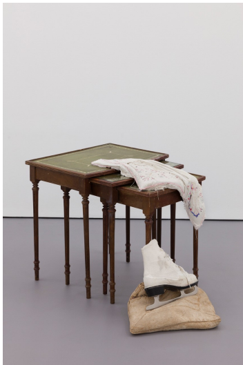
Rose Salane Nesting Tables , 2016 Wooden tables, plaster cast, ink on newsprint, glass Museum purchase with support from the Luria/Budgor Family Foundation, 2022.39