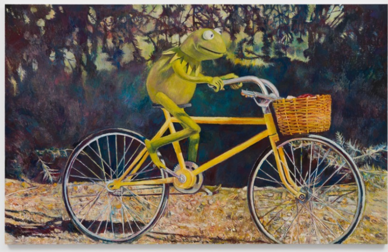
Keith Mayerson (American, b. 1966), Someday we'll find it, the Rainbow Connection, the lovers, the dreamers and me , 2023. Oil on linen, 55 1/8 x 88 in. SBMA, Museum purchase with funds provided by the Luria/Budgor Family Foundation.