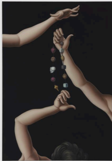
Jesse Mockrin Ritual, 2018 Oil on linen Gift of Peter Remes Family Collection 2021.37