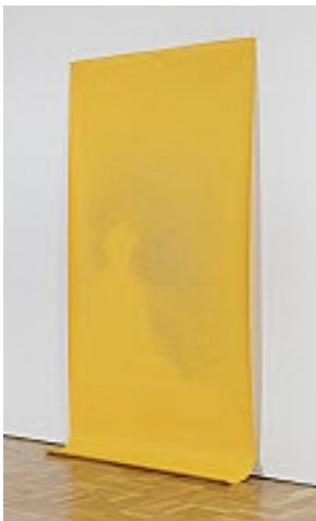
Tom Marioni (American, b. 1937) The Results of a Theatrical Action to Define Non-Theatrical Principles , 1979 Graphite on paper Museum purchase, 1980.15