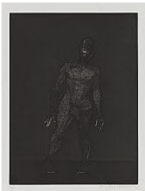
Kerry James Marshall (American, b. 1955) Frankenstein , 2010 Hardground etching, ed. 10/50 Museum Purchase with funds provided by the Cohn Acquisition Fund, 2012.5.2