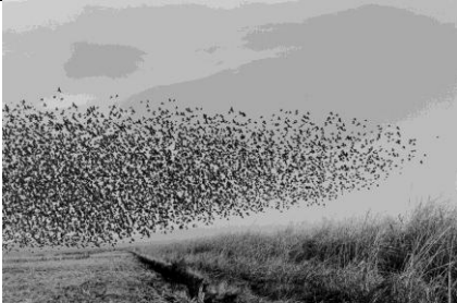
Lukas Felzmann Swiss, b. 1959 Swarm TBD , TBD 20 x 16" Gelatin silver print TBD LOAN