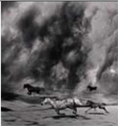
Loretta Young-Gautier American, b. 1960 Running from the Storm, 2000 gelatin silver print, AP 4 image-sheet: 16 x 15 7/8 in. (40.6 x 40.3 cm) mount: 24 x 20 in. (61 x 50.8 cm) SBMA, Gift of Loretta Young-Gautier