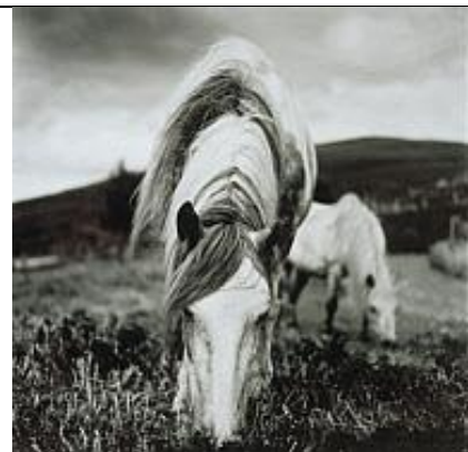
Keith Carter American, b. 1948 Skye Ponies , 1998 (printed 2000) toned gelatin silver print, ed. 16/50 15 3/8 x 15 3/8 SBMA, gift of Arthur B. Steinman