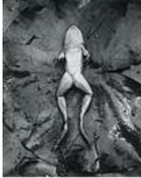
George A. Tice American, b. 1938 Aquatic Plant #7, New Jersey, 1967 Gelatin silver print Overall: 9 5/8 x 7 5/8 in. (24.4 x 19.4 cm) SBMA, Gift of David Shaw