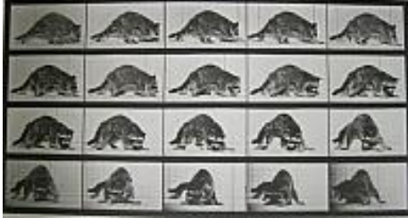
Eadweard Muybridge English, 1830-1904 (Active USA) Raccoon Turning Around , 1887 Collotype image: 8 x 15" sheet: 18 ¾ x 24" SBMA, Museum Purchase