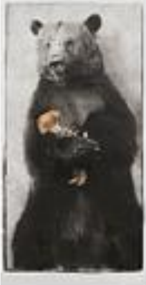
Gregori Maiofis Russian, b. 1952 We Like Your Toys But We Don't Trust You , 2013 Bromoil print image: 72 x 36 in. (182.9 x 91.4 cm) sheet: 79 x 39 3/4 in. (200.7 x 101 cm) SBMA, Museum purchase with funds provided by PhotoFutures