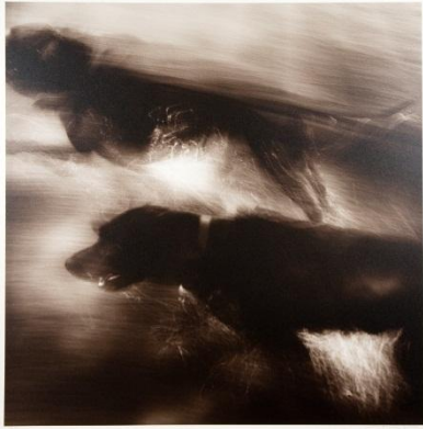
Jack Spencer American, 1951 Water Dogs , 1997 Toned gelatin silver print, ed. 14/50 image: 18 x 17 7/8 in. (45.7 x 45.4 cm) sheet: 20 x 24 in. (50.8 x 61 cm) SBMA, Gift of Arthur Steinman