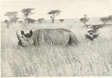
THIS RHOINOCEROS IS IN THE LAST OF COURAGE. THE BUSHMAN HAS NOT YET FOUND THE BUSHY HIDE, IN THE COURSE OF THE HIS HIDE. THE BUSHMAN HAS THE BUSHY HIDE. THE BUSHMAN HAS THE BUSHY HIDE. THE BUSHMAN HAS THE BUSHY HIDE. A BUSHY HIDE HAS THE BUSHY HIDE. THE BUSHMAN HAS THE BUSHY HIDE. THE BUSHMAN HAS THE BUSHY HIDE. THE BUSHMAN HAS THE BUSHY HIDE. THE BUSHMAN HAS THE BUSHY HIDE. THE BUSHMAN HAS THE BUSHY HIDE.