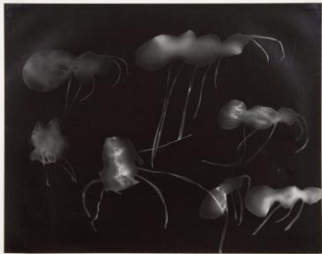
Unknown (Chez) Ants, Photogram 11 x 14 in Potential purchase TR