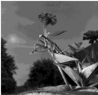
Larry Fink American, b. 1941 Cameo Portrait, Praying Mantis , 1978 Gelatin silver print sheet: 19 7/8 x 16 in. (50.5 x 40.6 cm) image: 15 1/8 x 15 1/2 in. (38.4 x 39.4 cm) SBMA, Gift of Arthur and Yolanda Steinman