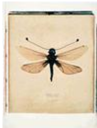
Linda L. Broadfoot American, b. 1965 Libelloides Sibericus (Siberian Owlfly) , 2002 Dye diffusion transfer print, ed. 5/5 image: 24 x 20 1/2 in. (61 x 52.1 cm) sheet: 30 x 22 3/8 in. (76.2 x 56.8 cm) SBMA, Museum purchase with funds provided by Eric Skipsey