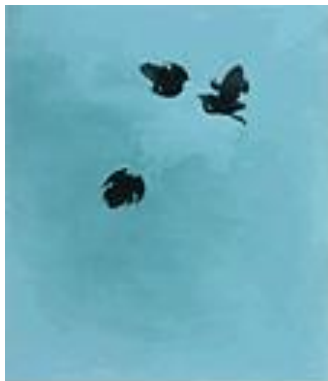
Kunie Sugiura Japanese, b. 1942 Hoppings I Positive 2 , 1996 Gelatin silver print Overall: 39 5/8 x 29 5/8 in. (100.6 x 75.2 cm) SBMA, Museum purchase with funds provided by the Wallis Foundation