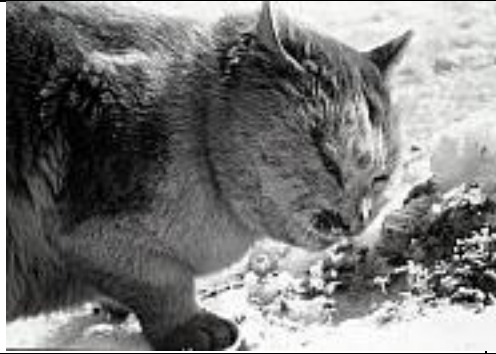
Masahisa Fukase Japanese, 1934-2012 Hakodate , 1975 Gelatin silver print Image: 8 x 11 in. Sheet: 8 1/2 x 12 in. SBMA, Museum purchase with funds provided by the Wallis Foundation