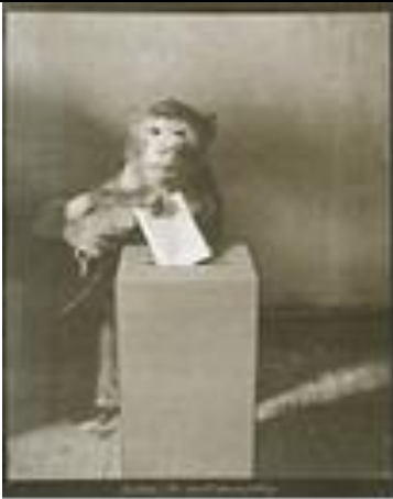
Gregori Maiofis Russian, b. 1952 Imitation Is The Sincerest Form of Flattery , 2006 Bromoil print, ed. 2/15 image: 19 1/4 x 15 3/4 in. (48.9 x 40 cm) sheet: 20 3/4 x 17 in. (52.7 x 43.2 cm) SBMA, Gift of the Artist