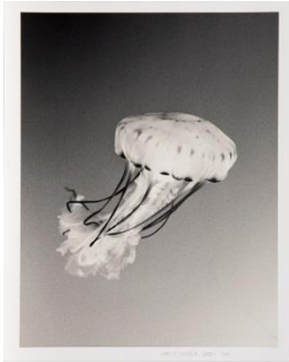
Camille Solyagua American, b. 1959 Jellyfish #9 , 2000 Toned gelatin silver print image: 9 1/4 x 7 1/4 in. (23.5 x 18.4 cm) sheet: 10 x 8 in. (25.4 x 20.3 cm) SBMA, Gift of Joseph Bellows Gallery