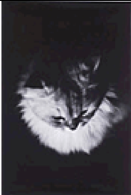
Yuichi Hibi Japanese, b. 1964 Hibi's Me-chan , 1993, printed 2008 gelatin silver print, ed. 1/15 image: 13 1/2 x 9 1/8 in. (34.3 x 23.2 cm) sheet: 14 x 11 in. (35.6 x 27.9 cm) SBMA, Museum purchase with funds provided by Lorna Hedges