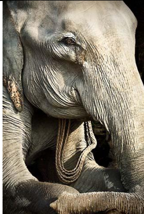
Joan Myers American, b. 1944 Elephant, India , 2013 Inkjet print 31 ¾ x 21 ¼" Purchase consideration