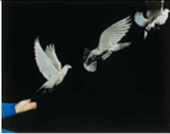
Harold Edgerton American, 1903-1990 Pigeon Released , 1965 Dye transfer print sheet: 16 x 20 in. (40.6 x 50.8 cm) image: 14 1/8 x 18 in. (35.9 x 45.7 cm) SBMA, Gift of the Harold and Esther Edgerton Foundation